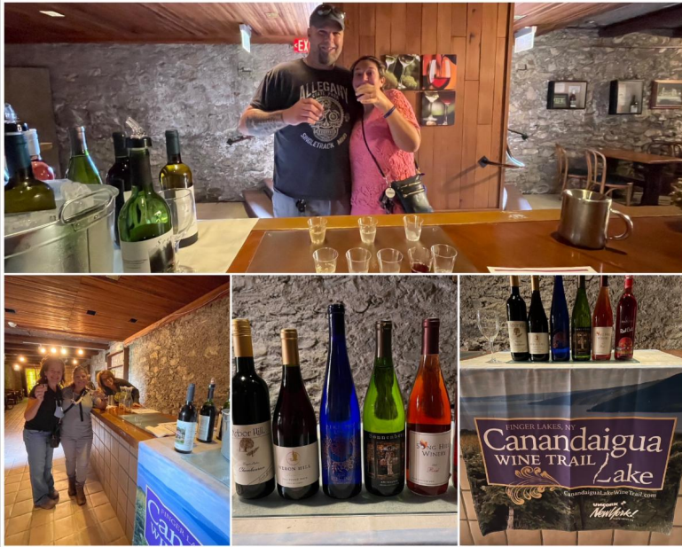
Trail, Arbor Hill, Song Hill, Heron Hill, Inspire Moore and Hazlitt.